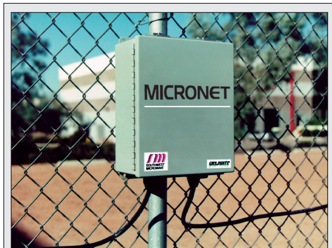
MICRONET™ MicroPoint™ Cable fence-mounted perimeter security system

The next-generation MICRONET™ system is designed for fast, accurate detection of any cutting or climbing of the fence, while ignoring vibrations from wind, rain or vehicles. Using microwave technology, MICRONET™ precisely identifies the site of a perimeter disturbance to within 10 feet of the event, and then transmits its location to security officers via a personal computer interface.