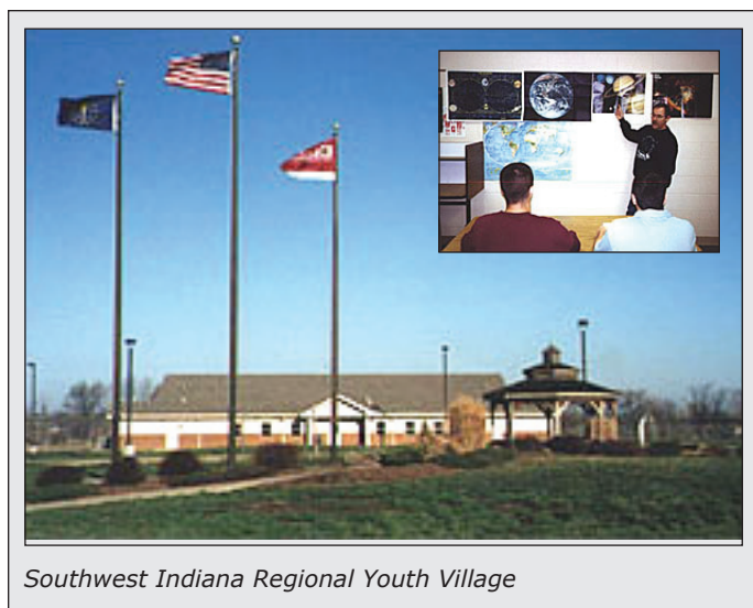
Southwest Indiana Regional Youth Village