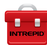
INTREPID™ POE Software Development Kit (SDK)