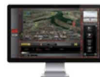
Perimeter Security Manager II (PSM II)

Contact us at infosd@southwestmicrowave.com or +1 (480) 783-0201 for further information or to request INTREPID™ SDK documentation.