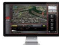
Perimeter Security Manager II (PSM II)