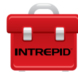
INTREPID™ Polling Protocol II (IPP II) - SDK Remote Polling Module II (RPM II) - SDK