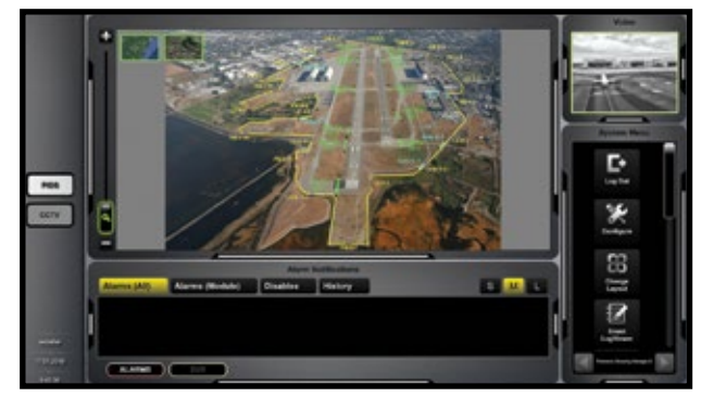
Manage site maps and live video on a single screen.