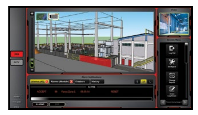
Incorporate high-resolution 2D or 3D graphics in common formats.