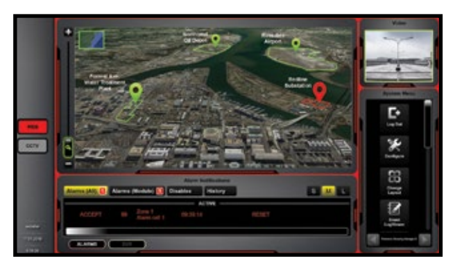
Easy site navigation with configurable 'portals'.

Scenarios are valuable, user-programmable system tools that maximize PSM II's integration capabilities. Scenarios also enable the security management system to make the majority of decisions – reducing the risk of human error. Devices being monitored or controlled by PSM II can be linked together and set to trigger a series of events when one or more actions or alarms occurs. For example, if an alarm signal is received, cameras can be switched to a pre-programmed location, a message sent to security personnel, gates opened or closed, and video activated to capture the incident in real time.