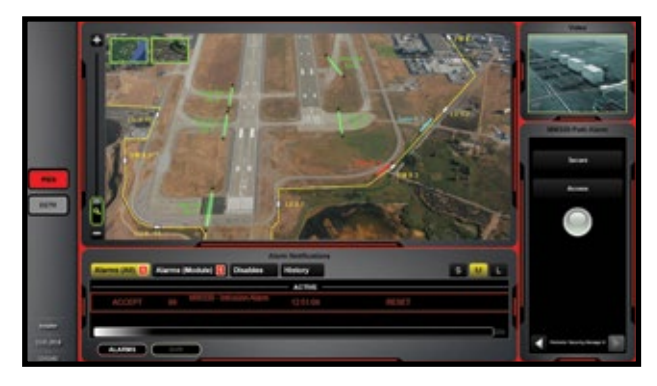
Clear on-screen event handling instructions for Operators.