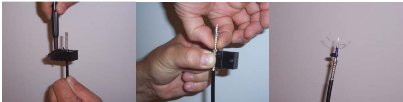
Figure 1: Preparing the MicroPoint Cable Ends

With an ohmmeter, check the resistance between the shield and each of the three remaining conductors. The resistance should be greater than six megohms. A measurement of less than 100 ohms indicates a short between the conductors - check the other end of the Sensor Cable and insure the wires are not shorted. A measurement between 100 ohms and six megohms indicates that water has entered the cable. This MUST be replaced with new cable. When the cable has been checked, leave the cable as is and begin to unreel.