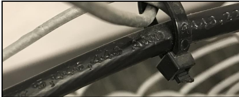
Example 1: New MC115 Sensor Cable: smooth jacket, shiny, bold black, supple feel.

A healthy cable should look somewhat shiny and appear soft to the touch. Sensor cables that appear dry or brittle and have cracks like those shown in Example 2 below should be replaced. Missing UV-resistant wire ties used to affix the sensor cable to the fence should also be replaced.